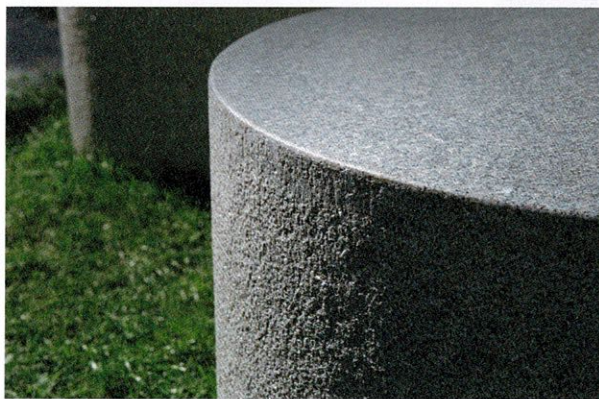
Trædesten Swedish granite