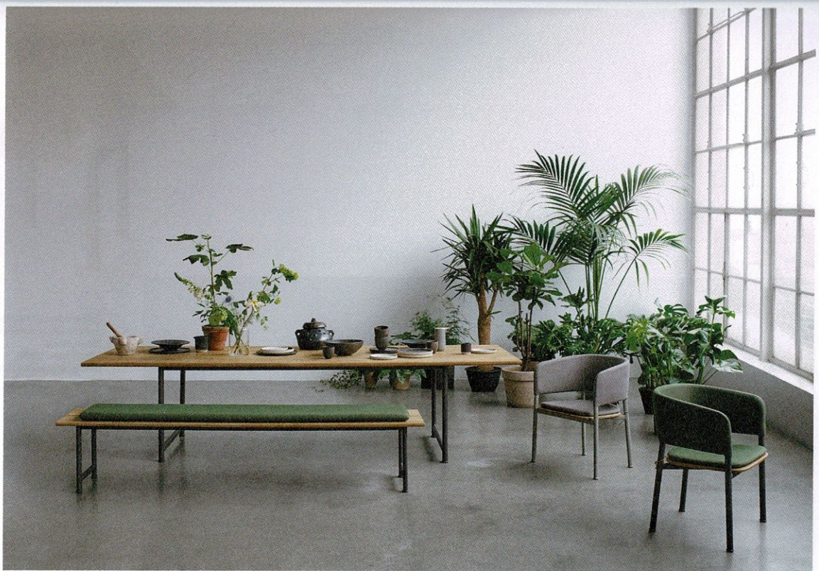
Atmosphere dining set O2 for Gloster